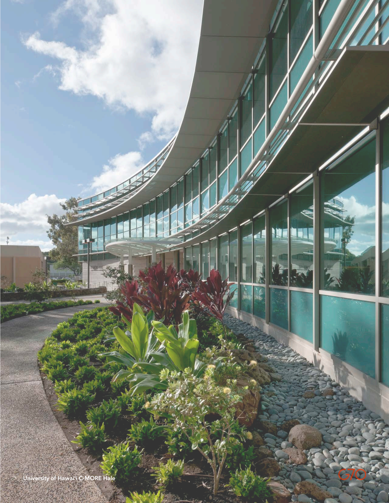
University of Hawai'i C-MORE Hale

Cultural heritage and regional influences are emphasized in G70's design approach. In Hawai'i, the firm coined the term "kama'āina architecture" to identify work that mirrors the 50th State's special ethnic blend. G70 principals, who take primary responsibility for capturing and characterizing each design's unique attributes, believe that the search for form is also a synergistic group process. This successful philosophy is rooted in the belief that clients deserve excellence at all levels of decision-making. The results are distinctive, award-winning environments that have a rich appeal, harmony and value over time.